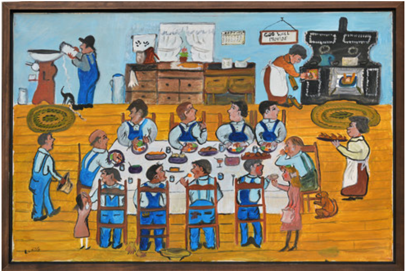
Emily Lunde, 1914 – 2003. Thresher's Meal , 1989. Oil on canvas. Collection of North Dakota Museum of Art

The threshers meal allowed the women to outsmart the neighbors with their culinary skills. The only fresh meat available at that time of year was chicken. After a long threshing session, they were happy with milk mush. The young people had a chance to meet the new hired help. The world was twenty miles wide when they had to rely on horses. Many families had many unmarried people due to transportation. The oldest generally took the team and the rest stayed home. The model T. Ford helped some but was not adequate.